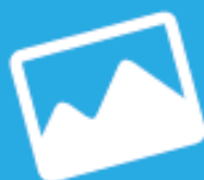
Image Type - Select DOCUMENT (if scanned as Photo it will show paper imperfections and make plate look dirty).

Resolution - should be set at least 300dpi high resolution.